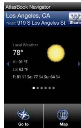
Weather: Real-time localized content